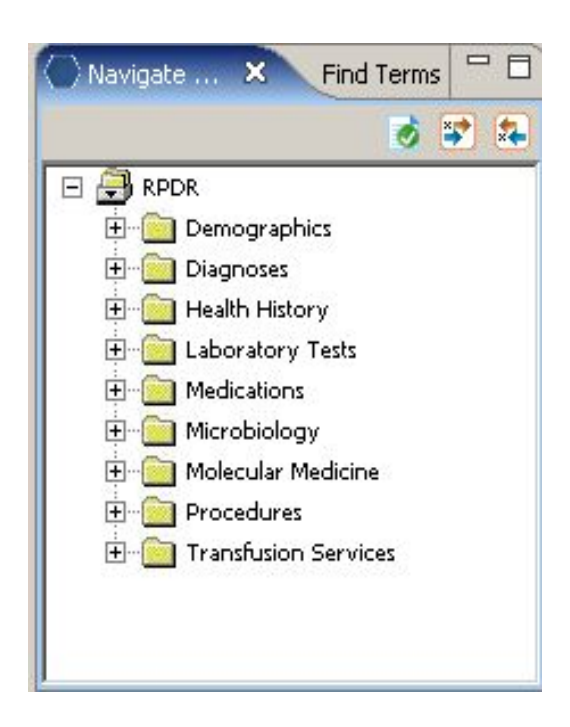
Example 2: c_hlevels 0, 1 and 2